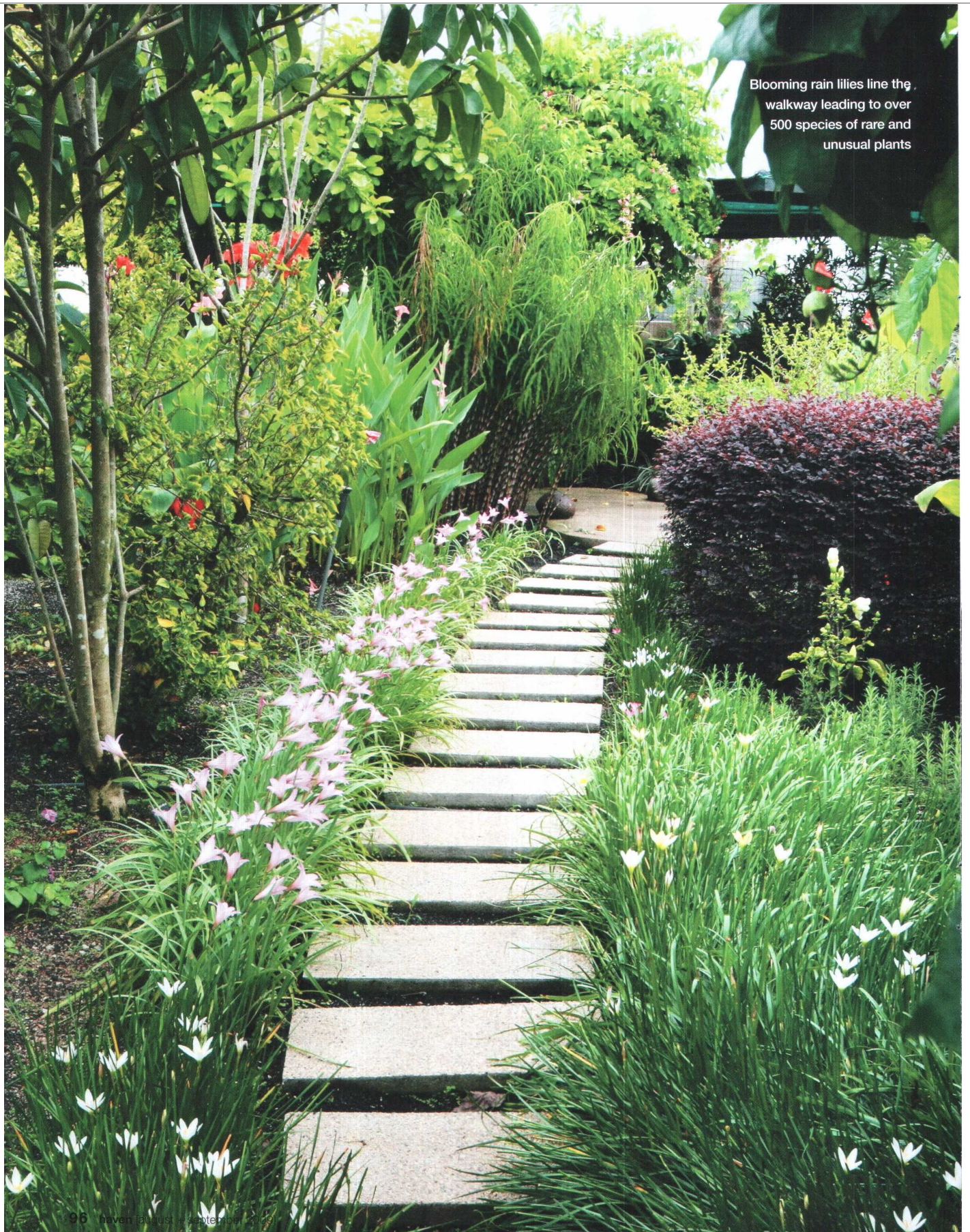
Blooming rain lilies line the walkway leading to over 500 species of rare and unusual plants

Language English Page No 96 to 98 Article Size 1363 cm 2 Color Full Color PRValue 73,120